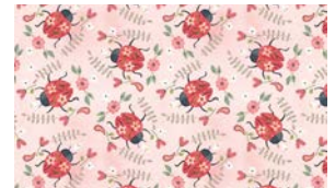
4410-22 Lady Bugs Light Pink