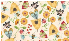
4405-41 Beehives and Flowers Pale Yellow

All fabric quantities are based on 15yd bolts unless otherwise indicated.