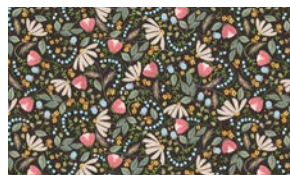
4413-99 Mixed Flowers Black