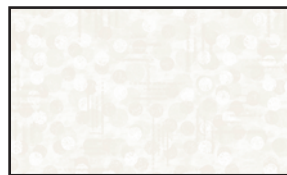
9570-09 Jot Dot Marshmallow