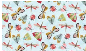
4408-70 Butterflies, Dragonflies, and Ladybugs Light Blue