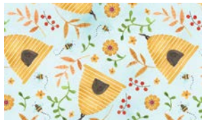
4407-70 Beehives and Leaves Light Blue