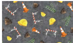
4397-95 Construction Hat, Traffic Cones, Ladders Dark Grey