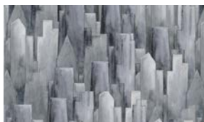
4401-90 City Skyscrapers Grey