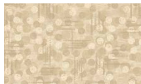
9570-30 Jot Dot Beige