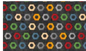
4398-99* Nuts Dark Grey