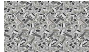
4399-98 Nuts and Bolts Grey