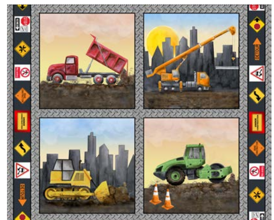
4402B-41 Construction Equipment Pillow Blocks Multi