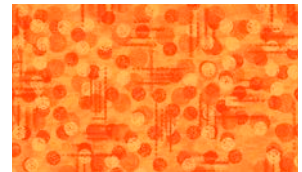
9570-33 Jot Dot Orange