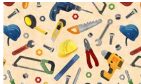
4396-41 Tools Peach