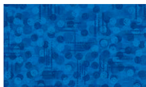
9570-77 Jot Dot Dark Blue