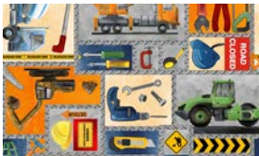
4394-90 Construction Equipment Multi

All fabric quantities are based on 15yd bolts unless otherwise indicated.