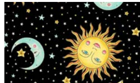
4451-99 Sun, Moon and Stars Black