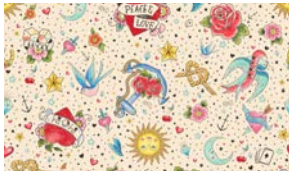
4445-41 Tattoo Art Cream

All fabric quantities are based on 15yd bolts unless otherwise indicated.