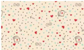
4450-41 Playing Cards, Hearts, Stars and Anchors Cream