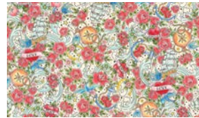
4448-41 Tattoo Art Cream