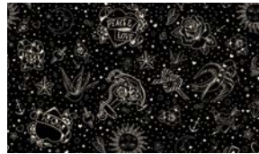
4447-99 Tattoo Art Black