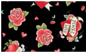
4446-99 Rose and Heart Tattoos Black