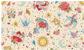
4445-41 Tattoo Art Cream

All fabric quantities are based on 15yd bolts unless otherwise indicated.