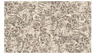
4449-41 Linework Tattoo Art Cream