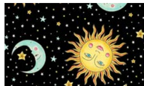
4451-99 Sun, Moon and Stars Black