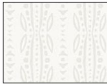
3736-01 Stripe White