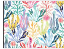
3733-01 Seaweed White