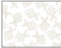
3729-01 Tossed Fish White on White