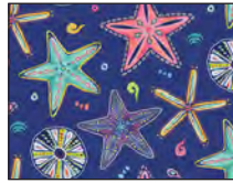
3732-77 Starfish Dk. Blue