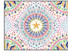
3734-01 Mandala Allover - White