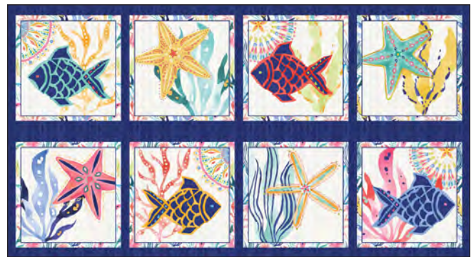
3737-01 Fish and Seaweed Blocks Dk. Blue

Selected fabric from the M lange Collection