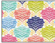
3731-01 Allover Geometric Abstract White