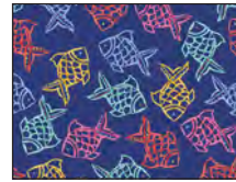
3729-77 Tossed Fish Dk. Blue