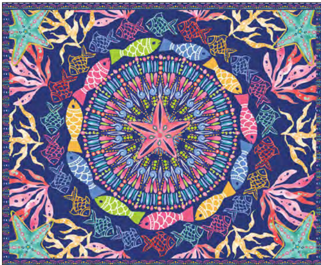
3738P-77 Mandala and Fish Panel 36\"/>