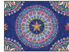
3730-77 Spaced Mandalas - Dk. Blue