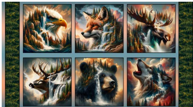
4168-70 Wildlife Blocks Lt. Blue