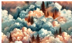
4176-75 Clouds with Trees Blue