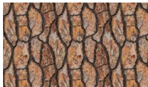
4170-39 Tree Bark Brown

All fabric quantities are based on 15yd bolts unless otherwise indicated.