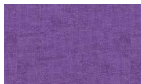
4509-511 Stof Melange Basic Purple

** Creative Grids 45 Degree Half-Square Triangle Ruler recommended ** ** Additional 1/4 yard 3955-JET BLACK included in yardage requirements for coping strips ** ** Panel trimmed to 22 1/2" x 40 1/2" and coping strips added **