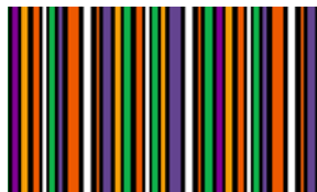
3981G-35* Pin Stripes Orange