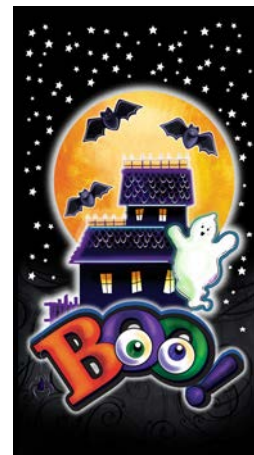
3992PG-99 Panel Black