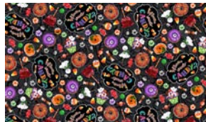
3983G-99 Candies Black