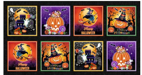
3990G-99 Eight Blocks Black

** Yardage requirements are based on the panel blocks being cut at 10" x 10" **