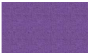
4509-511* Stof Melange Basic Purple