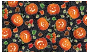
3985G-99 Pumpkins Black