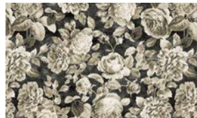
4113-95 Floral Charcoal