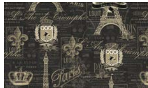
4112-95 Eiffel Tower with Crests and Crowns Charcoal