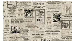
4114-30 French Labels Parchment