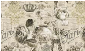
4106-30 Paris Floral Parchment