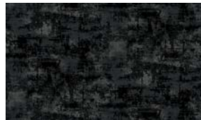
3188-99* Intermix Black