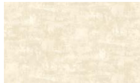
3188-41 Intermix Cream