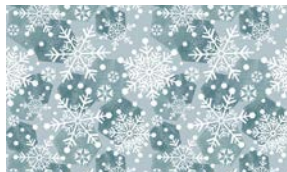
4250-70 Snowflakes Lt. Blue