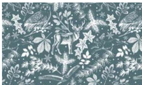
4249-75* Winter Silhouettes Teal