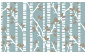
4253-72 Trees Trunks with Birds & Squirrels Med. Blue