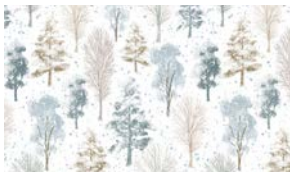
4248-01 Winter Trees White

All fabric quantities are based on 15yd bolts unless otherwise indicated.