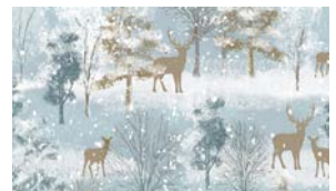
4252-70 Winter Scenic Lt. Blue