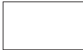
3955-White Eclipse White