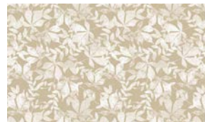
4251-30 Leaves Tan